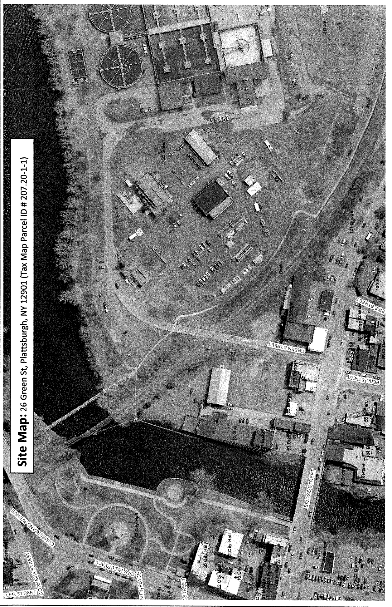
Site Map: 26 Green St, Plattsburgh, NY 12901 (Tax Map Parcel ID # 207.20-1-1)